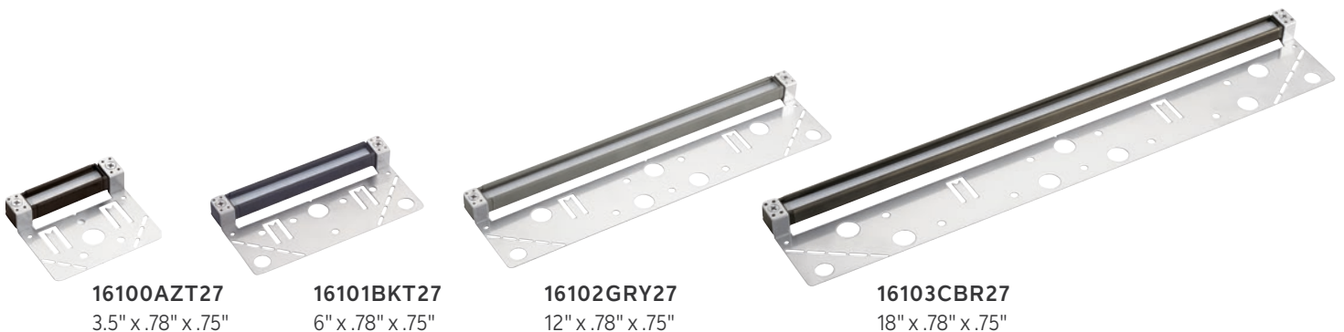
16100AZT27 3.5" x .78" x .75"

Consult Kichler Advanced Product Solutions for additional product support and design layouts by visiting Kichler.com/APS .